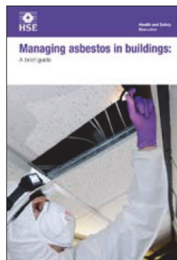
This is a web-friendly version of leaflet INDG223(rev5), revised 04/12