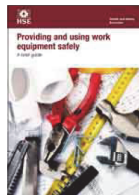
This is a web-friendly version of leaflet INDG291(rev1), published 03/13